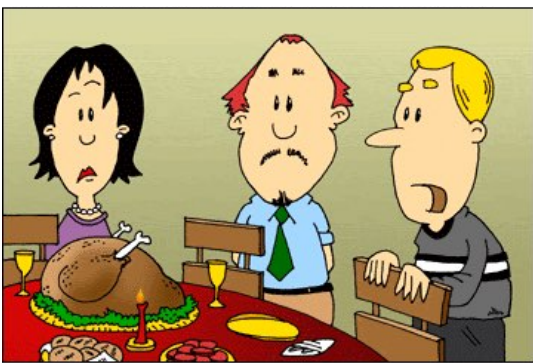
(See Psalm 100) 11-28-2002 HAS IT ALREADY BEEN A YEAR SINCE WE WERE THANKFUL?

December 14, 15, Tuesday, Wednesday - Angel Tree presents delivered.